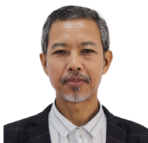
Wailes Rangsa Bangladesh